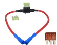
Micro 3 Add A Circuit Fuse Holder Standard - 20A/20A Splashproof Waterproof IP67

FH450 - 2 Per Pack FH597 - 2 Per Pack 0-376-89 - 5 Per Pack