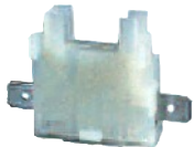
In-line Blade Holder -