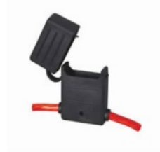
Maxi Blade Fuse Holder Splashproof Max 100a Continuous