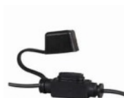
Mini Blade Fuse Holder FH595, - 30Amp, with Lid,

10 Or 100 Per Pack 10 Or 100 Per Pack 10 Or 100 Per Pack 10 Or 100 Per Pack