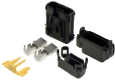
Maxi Blade Fuse Holder Splashproof