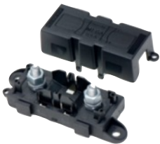
Mega Fuse Holder 2 X 8mm Bolts Can Be Clipped Together To Form A Fuse Block