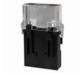
Maxi Blade Fuse Holder With 2 sizes of terminal