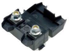
Midi/strip Fuse Holder 2 X 5mm Bolts Max Cable Size 16mm 2