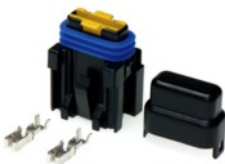
In-line Blade Holder Splashproof