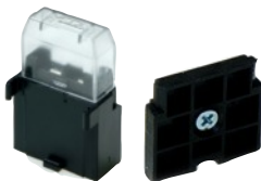
In-line Blade Holder - Holder - Plastic Cover - Fixing Plate -