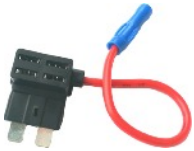
Add A Circuit Fuse Holder Standard Blade Fuse -