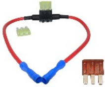
Micro 3 Add A Circuit Fuse Holder

Standard - 20A/20A Splashproof Waterproof IP67