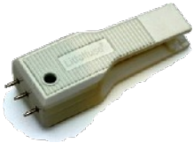
Blade Fuse Tester/Extractor

When the three pins are placed on the exposed metal part of the blade fuse the green indicator light will glow if the fuse has not blown.