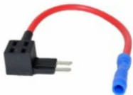
Add A Circuit Fuse Holder Micro2 Blade fuse -