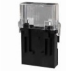
Maxi Blade Fuse Holder With 2 sizes of terminal